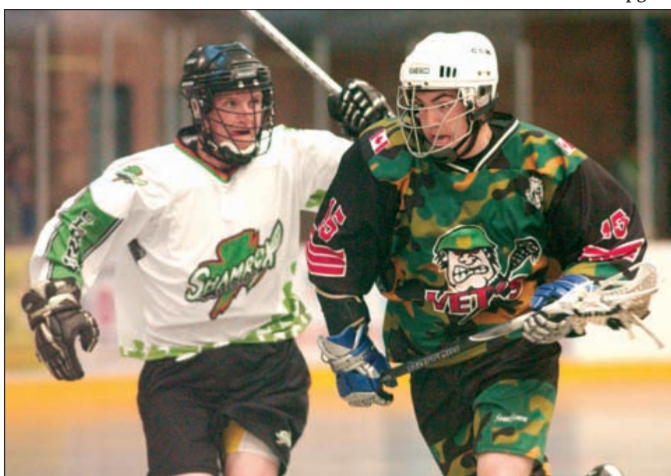
TOUGH WEEKEND. It was a long weekend of a different kind for the Shelburne Vets who saw their season record fall to 3-5. On Friday night at the Bunker, Shelburne gave up a two goal lead late in the third to be edged by Centre Wellington 12-11 in overtime. Playing in Clarington Sunday evening, they dropped an 18-4 decision to the Shamrox's followed by a 13-5 loss at the hands of the Caledon Bandits in Mayfield on Tuesday night. Shelburne will be looking to return to the win column this Sunday when they play host to Innisfil at the CDRC where the two teams will take the floor at 7 p.m.