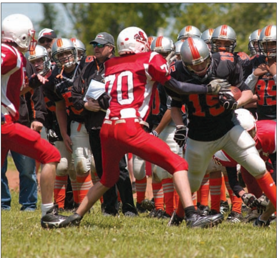
HIGH WINDS may have stalled their aerial assault but the Peeewe Outlaws ground offensive proved to be just as potent when Orangeville rolled over the Halton Hills Wildcats 38-0 in Ontario Minor Football League play at Westside Secondary this past Sunday.