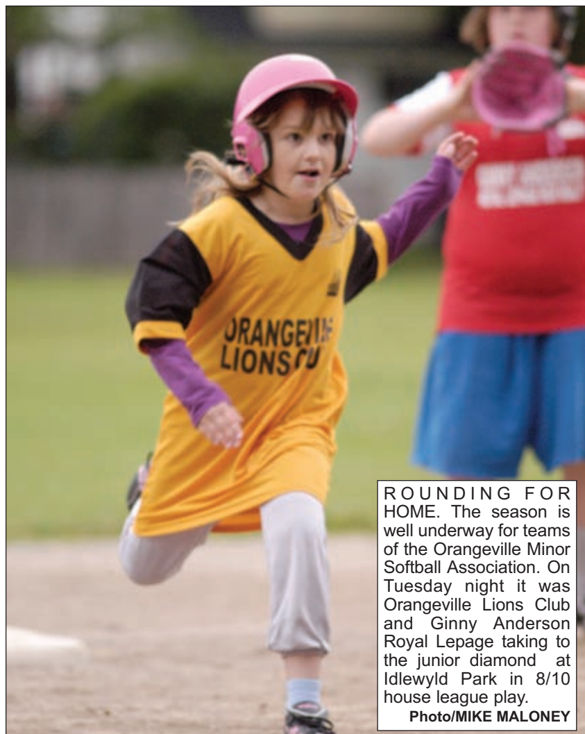
ROUNDING FOR HOME. The season is well underway for teams of the Orangeville Minor Softball Association. On Tuesday night it was Orangeville Lions Club and Ginny Anderson Royal Lepage taking to the junior diamond at Idlewyld Park in 8/10 house league play.