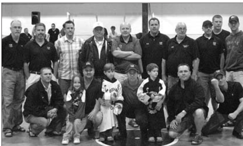
30th ANNIVERSARY. Members of the 1989 Orangeville Northmen Junior B team gathered at centre floor of the Tony Rose Memorial Sports Complex on Saturday to mark the occasion of the 30th anniversary of back to back Founders Cup Championships won by the team in '89 and 1990.

Action resumes this weekend when Kitchener-Waterloo comes to town for the first meeting of the two clubs this season on Friday then its a rematch with the Chiefs in Burlington on Monday night with the opening draw schedule for 8 p.m. both nights.