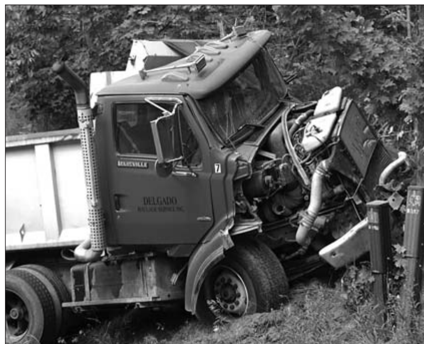
ACCIDENT CLOSES HOCKLEY ROAD: At approximately 8 a.m. Wednesday a truck left the road at the intersection of Hockley Road and Third Line Mono, causing Hockley Road to be closed for a number of hours. The driver was taken to hospital with undetermined injuries. The investigation was still underway at press time and there was no announcement if charges had been laid.