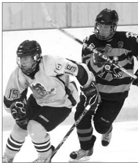
ORANGEVILLE CRUSHERS continue to prepare for their upcoming 2009-10 campaign. On Friday night, the Crushers defeated Mississauga 6-4 in exhibition play at the Alder St. Community Centre.