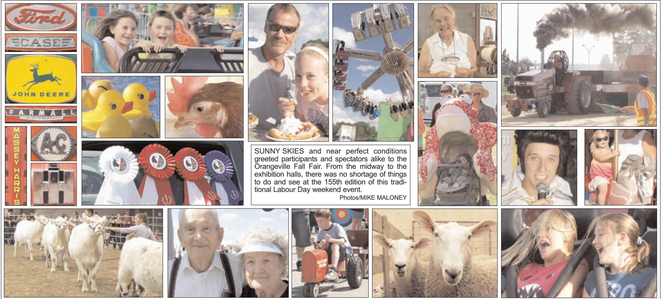
SUNNY SKIES and near perfect conditions greeted participants and spectators alike to the Orangeville Fall Fair. From the midway to the exhibition halls, there was no shortage of things to do and see at the 155th edition of this traditional Labour Day weekend event.