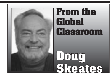
From the Global Classroom

Thursday, September 30, 1909 • The 42nd annual exhibition of the Dufferin Central Agricultural Society, held in Shelburne Tuesday and Wednesday, bumped up against the worst dose of wet weather the Society has been "favoured" with for